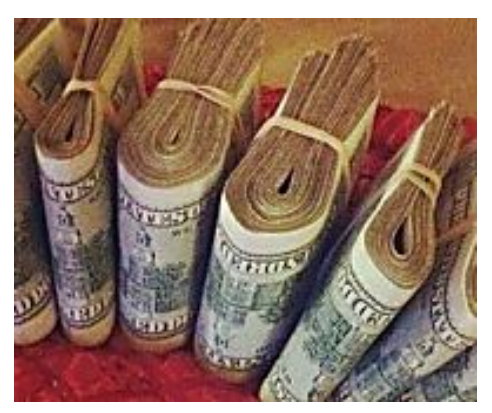
Homeowners Who Have Not Missed A Payment in 3 Years Are In For A Big Surprise Comparisons.org Quotes