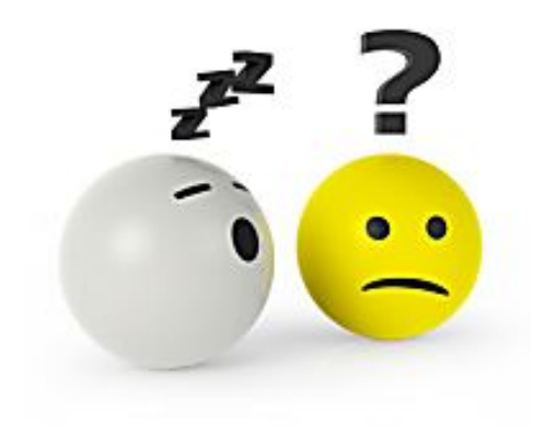
A Solution That Puts Snoring to Bed My Snoring Solution