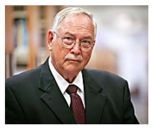
Pay Off Your House At A Furious Pace If You've Not