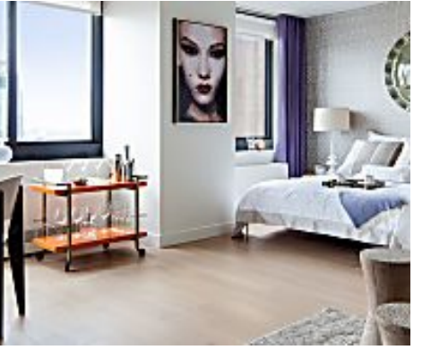
10 Amenities You Can't Live Without